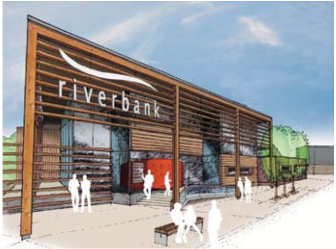
An artist's impression of how Riverbank will look

KVAT already has an option to the land at a minimal rent from