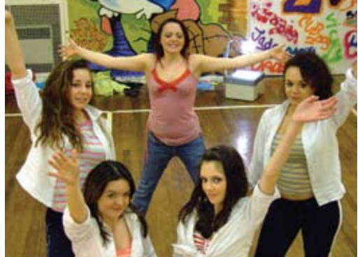
Positive Images

The Positive Images project – a collaboration between KVAT and Marlborough Youth Development Centre, funded by the Local Network Fund for Children and Young People – was completed last December.